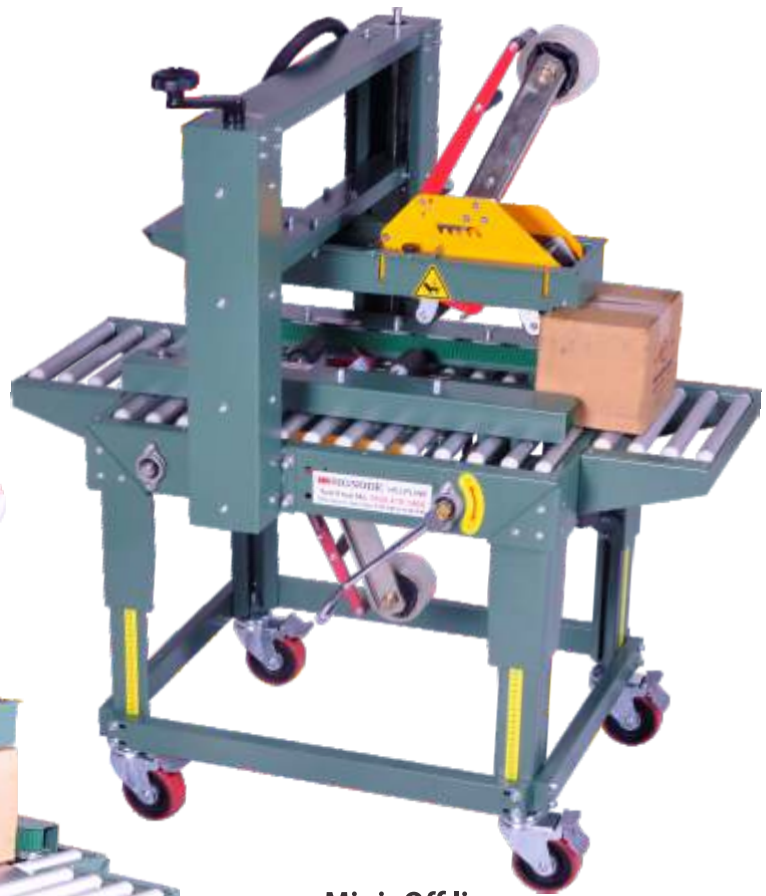
Mini- Off line